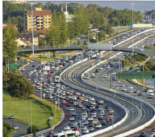
Source 2 Busy streets in cities can make moving around difficult.