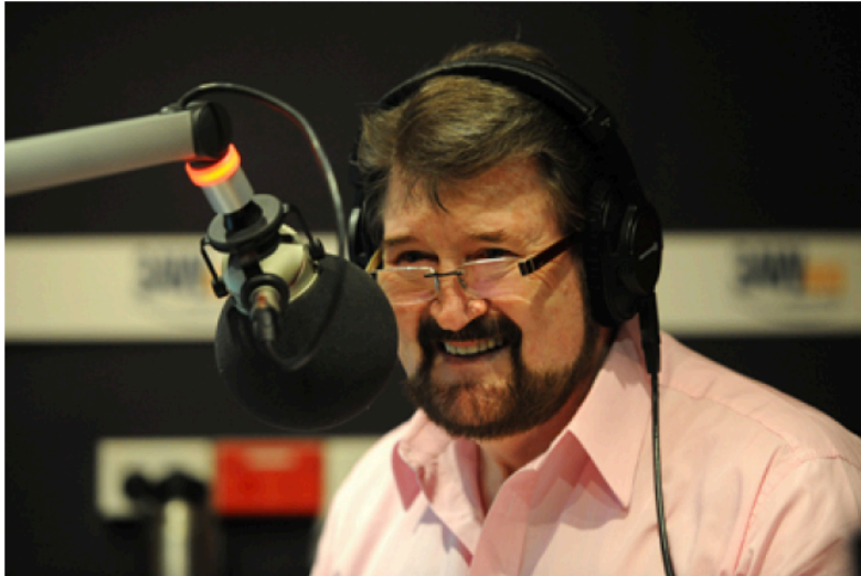
FIGURE 3 Radio broadcaster, Derryn Hinch

plead guilty. Hinch was ordered to pay a $100 000 fine, but he refused to pay the fine and spent 50 days in prison instead.